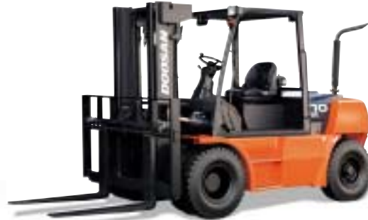
D50S / D60S / D70S / D80S / D90S-5 5,000kg 6,000kg 7,000kg 8,000kg 9,000kg Diesel ; Pneumatic Tire