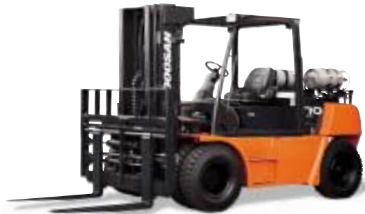
G50S / G60S / G70S-5 5,000kg 6,000kg 7,000kg LP Gas ; Pneumatic Tire